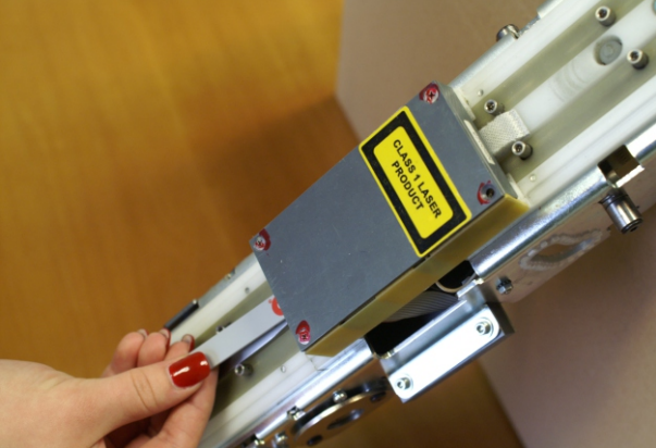
Attention: While insertion the cleaning pad has to face upwards!

Please move the tool through the channel in such a way that the pad can be seen from the upper side. After the cleaning dispose of the tool.